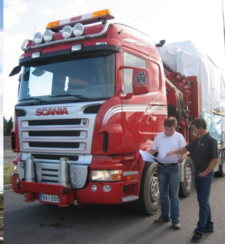
Another home by Heikius Homes is just about ready.