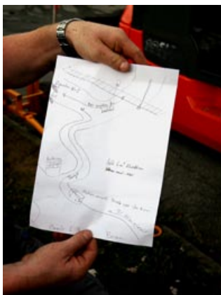
The road may look daunting for a big vehicle, but fortunately any place is accessible with a truck-mounted forklift.

”Since both the truck and trailer are covered, the choice was quite simple. A forklift could also be multipurpose. Being able to drive a few kilometers closer to the loading site with the forklift is no problem when the truck can’t get through.”