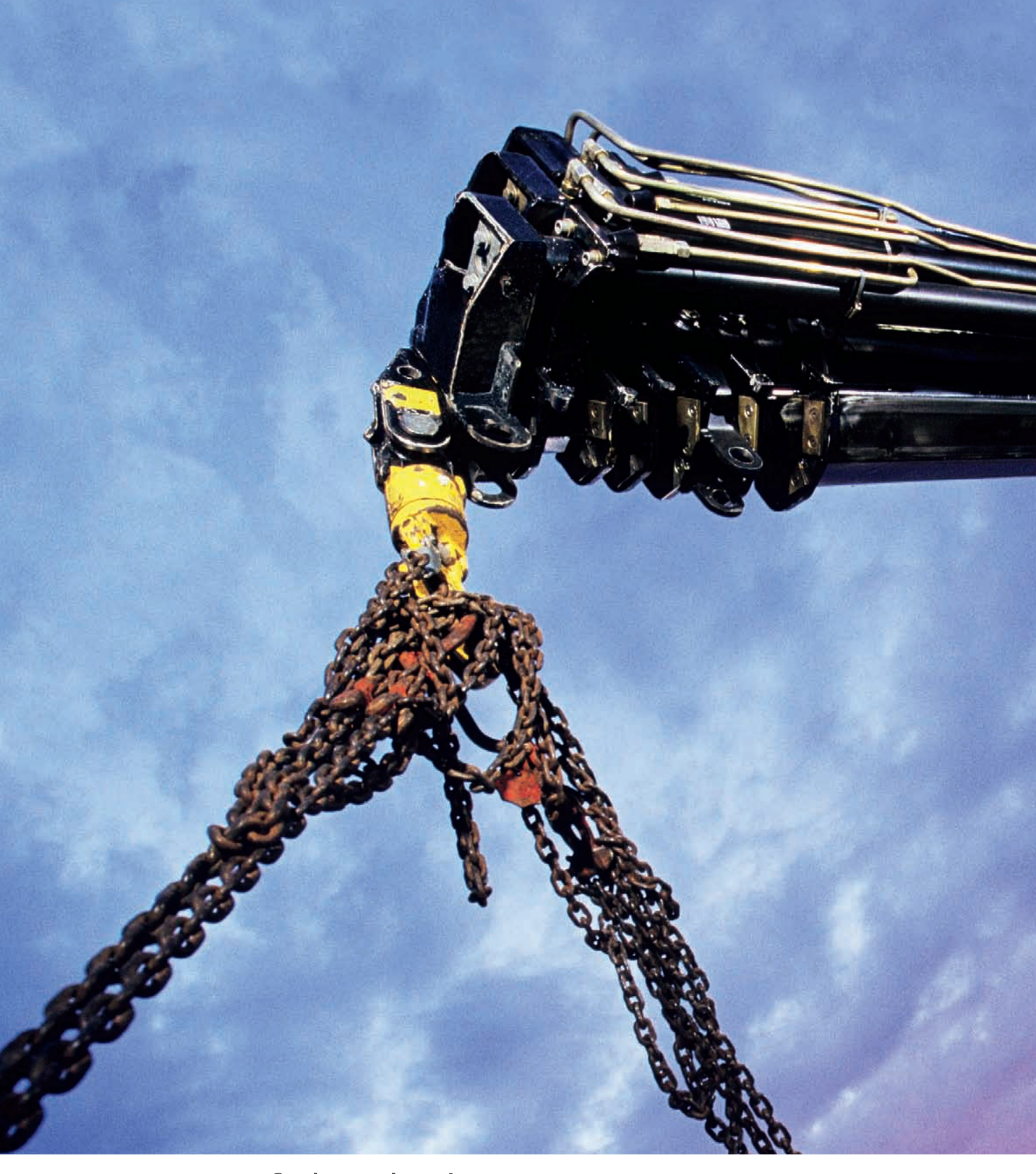
A powerful solution