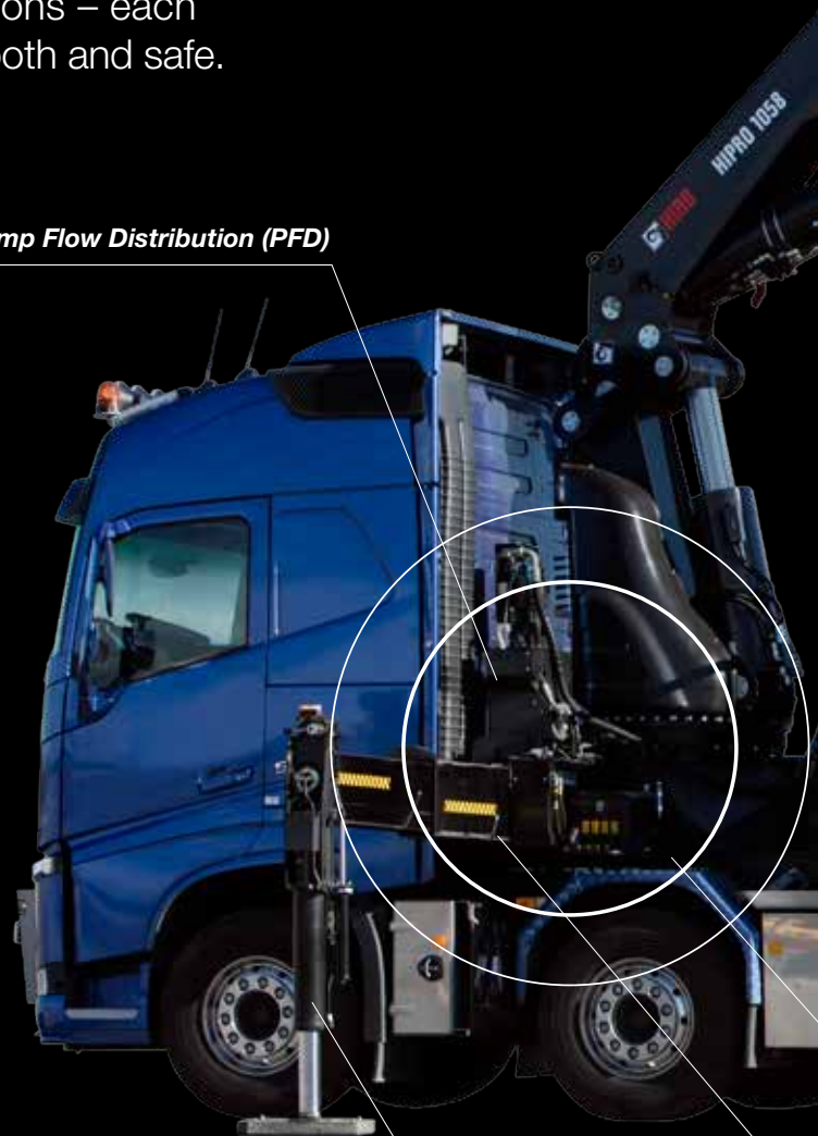
Easy tilting of stabiliser legs