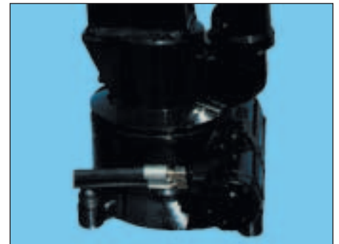
The O-ring-sealed slewing housing of cast steel with an encased worm gear prevents water and dirt from entering.