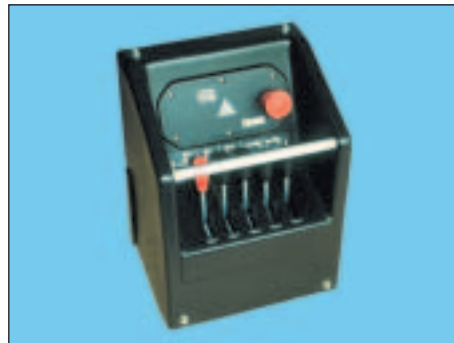
The control valve and BOSS® safety and control system (on CE-marked cranes) are placed in a protective box.