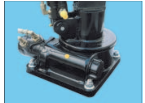
The O-ring-sealed slewing housing of cast steel with an encased worm gear prevents water and dirt from entering.