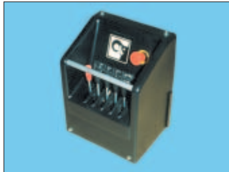
The control box covers the manoeuvring valve and an aluminum bar protects the control levers.