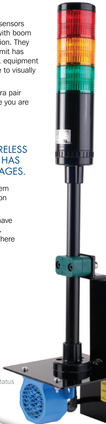
LED & Horn Systems Status

The HiVolt Alert™ is an early warning system. Operators must still be aware of and cautious around high voltage power lines. HiVolt Alert™ gives you an easy-to-use tool for a more safe and secure job site.