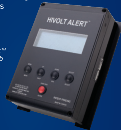
HiVolt Alert™ Display Hub