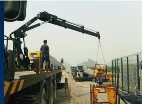
Remote-controlled loader cranes were the best solution because of the uneven terrain.

The 75 loader cranes delivered by Hiab put in long hours at the construction site. The 25 HIAB XS 288 loader cranes at the railroad construction feature the SPACE 4000 safety system and XSDrive remote control system. Additionally, the support legs were removed for better integration with the frame. Due to the challeng-