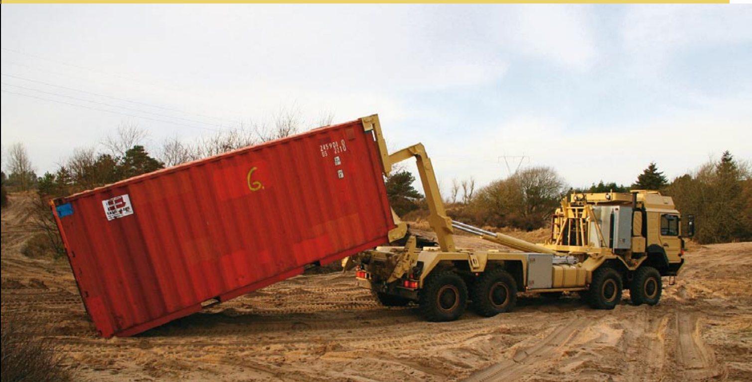
MULTILIFT MSH 165 SC hooklifts specially designed for the defence forces and with a lifting capacity of 16.5 tonnes will be serving in the Danish defence forces.