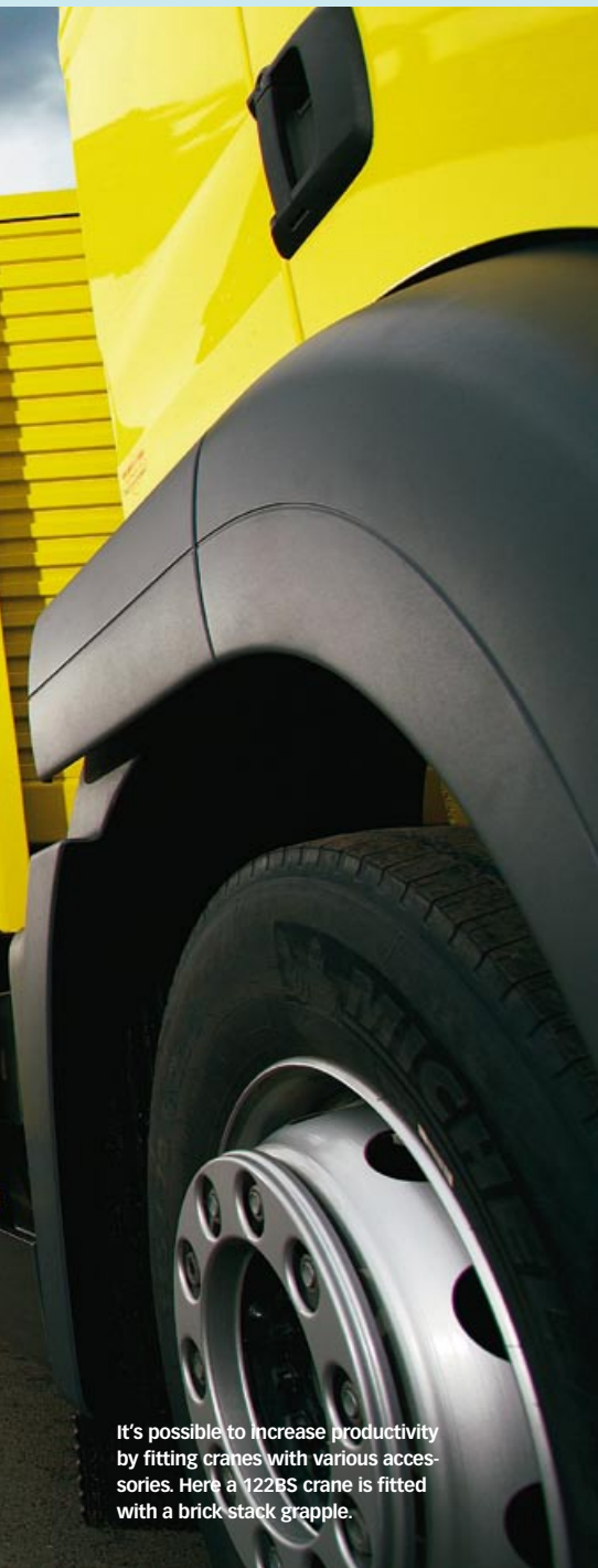
It's possible to increase productivity by fitting cranes with various accessories. Here a 122BS crane is fitted with a brick stack grapple.